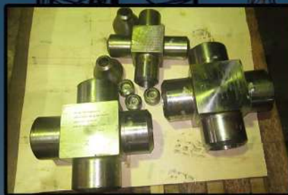
Blk Studded Cross, End Caps, Concentric Reducers