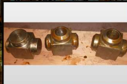
Block Target Tee