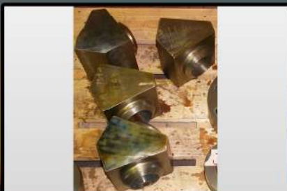
Blk 45 Deg Elbows