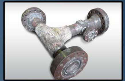
Flanged Long Sweep Tee