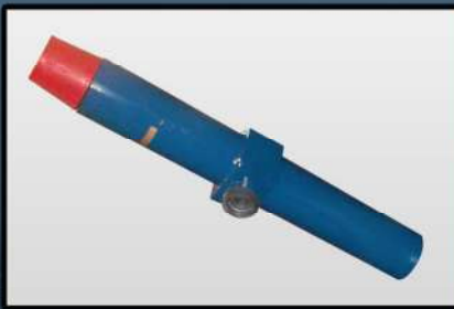
Side Entry Sub