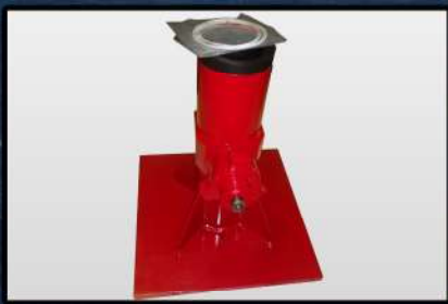
Test Stand for Safety Valve