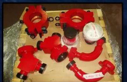
Union Y-Blocks, Union Elbows, Clamps