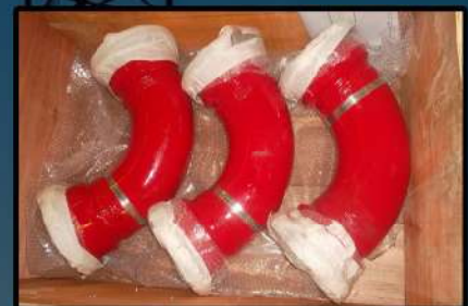
90 Deg Elbows