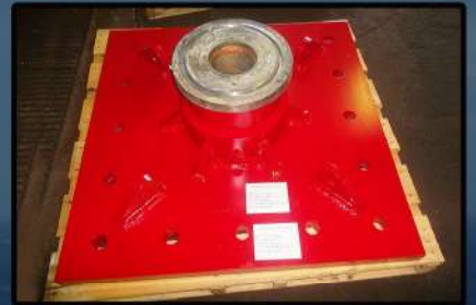
Test Stump with API Hub