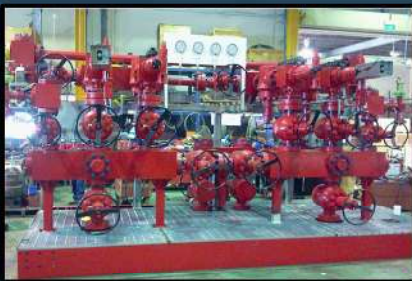
Choke & Kill Manifold