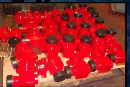
Union Block Elbows